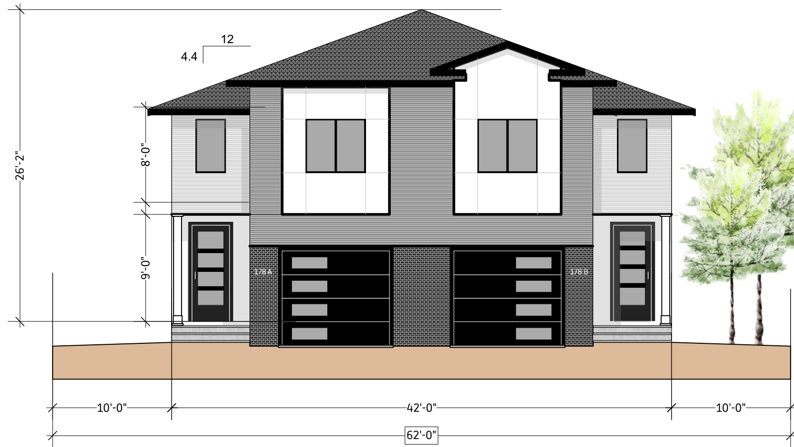
Street Elevation scale: 1/8: 1.-0"